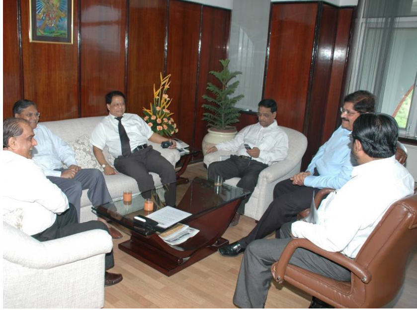
All Director and ED(P&A)assembled in the chamber of Chairman SAIL