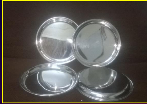
SAIL FULL PLATE