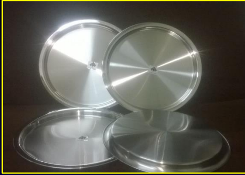
ODYSSEY FULL PLATE