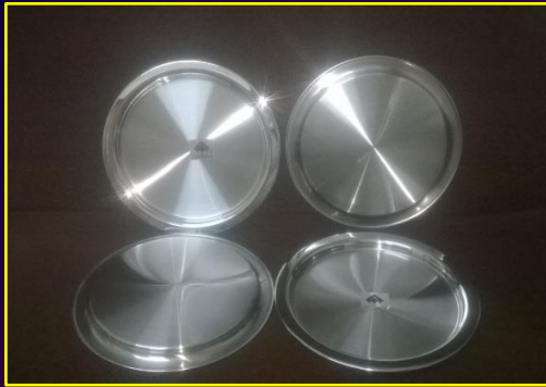
ODYSSEY HALF PLATE