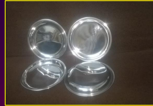
SAIL QUARTER PLATE